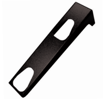
Double Barrel Rest