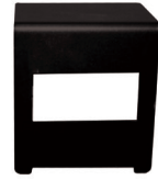
Top Shelf Support Bracket (Defender® series only)