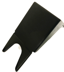
Single Barrel Rest (Defender® 17 only)