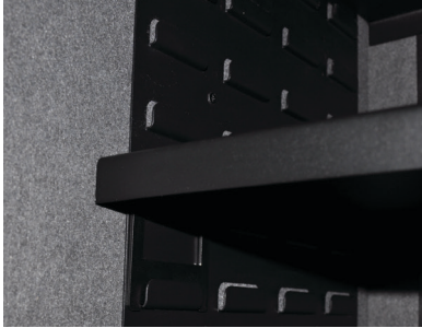
Image at left shows proper placement of Top Shelf Support Brackets to securely install Top Shelf.

NOTE: Defender® 44 model tactical gun safe comes with 2 shelves.