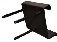
3-pin Handgun Rack (Defender® 25 only)