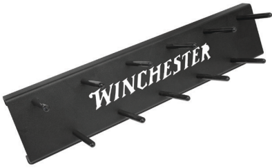
11-pin Handgun Rack