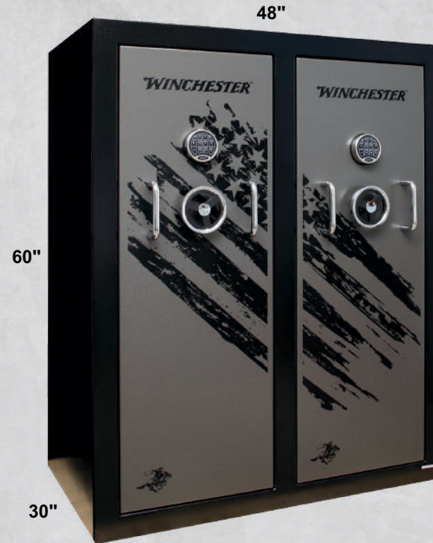
DEFENDER DOUBLE DOOR